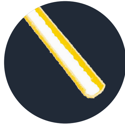
FRP Half Round Rung Cover