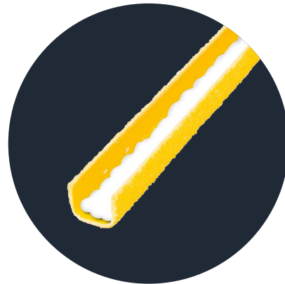
FRP Square Rung Cover